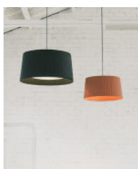
GT5 / GT6