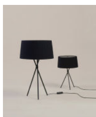
Trípode G6 / M3