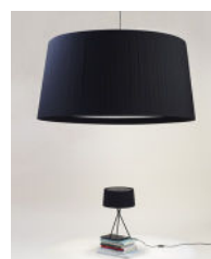
GT1000 / GT1500